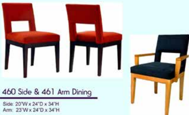
460 Side & 461 Arm Dining

Side: 20"W x 24"D x 34"H Arm: 23"W x 24"D x 34"H