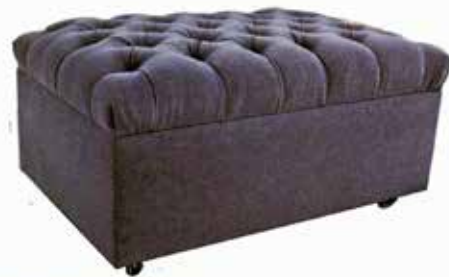
2475 Tufted Storage Ottoman 36" W x 30"D x 19"H