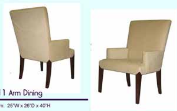
711 Arm Dining