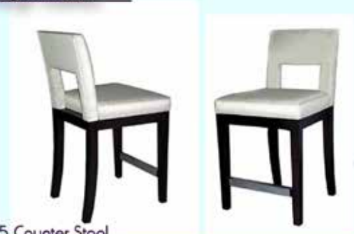
465 Counter Stool