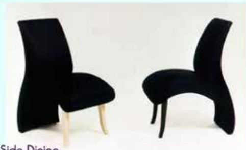
680 Side Dining