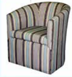
1001 Low Arm Boxed

25"W x 28"D x 31"H Also Available: Pedestal Base, Tight Seat