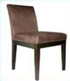
460NH Side & 461NH Arm Dining

Side: 20"W x 24"D x 34"H Arm: 23"W x 24"D x 34"H