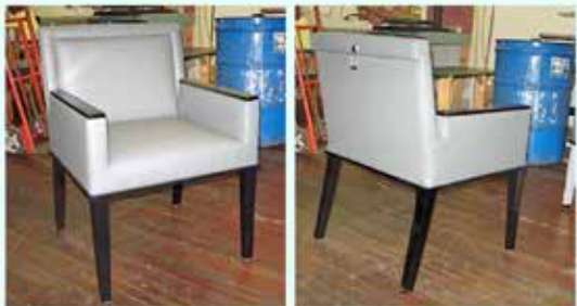
971 Arm Dining Chair