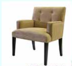
340 Side Dining

Arm: 25"W x 28"D x 34"H Side: 25"W x 28"D x 34"H Also Available: Dining Bench