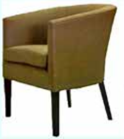
1000 High Arm

25"W x 25"D x 32"H Also Available: Pedestal Base, Tight Seat