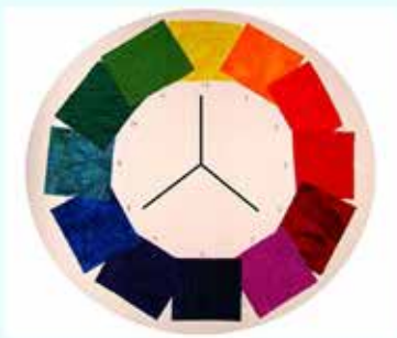
Triad Color Wheel