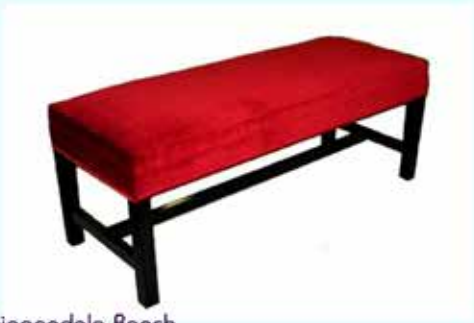
100-B Chippendale Bench