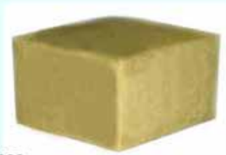
170 Ottoman & 410 Ottoman