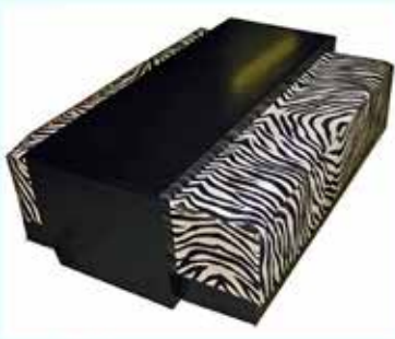
065 Ottoman with Table

36"W x 48"D x 15"H – Table: 52"W x 18"D x 18"H