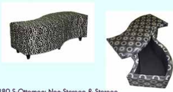
280 S-Ottoman: Non-Storage & Storage 50"L x 24"D x 18"H