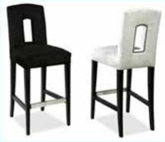
558 Window Back Barstool