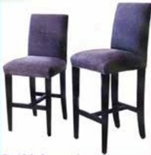
495 Counter & 498 Barstool

495: 17"W x 18"D x 39"H 498: 17"W x 18"D x 43"H