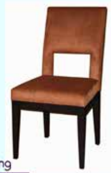
460 Highback Side Dining

Side: 20"W x 24"D x 38"H Arm: 23"W x 24"D x 38"H