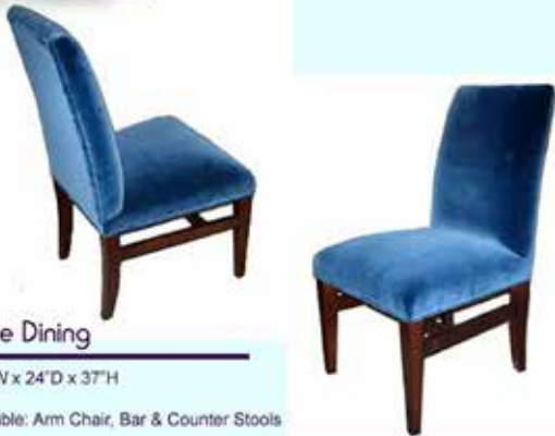
490 Side Dining