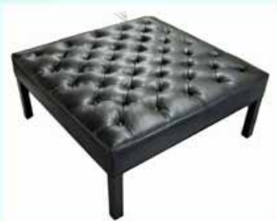
085 Tufted Ottoman