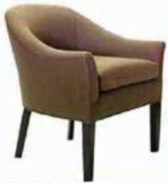
1002 Flair Arm

27"W x 29"D x 32"H Also Available: Pedestal Base, Tight Seat