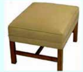
110 Queen Anne & 100 Chippendale

110: 22"D x 28"W x 18"H 100: 22"D x 28"W x 18"H