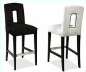
558 Window Back Barstool