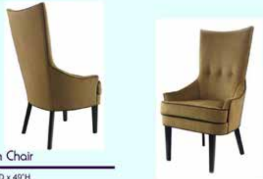
351 Arm Chair