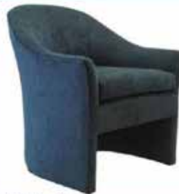
1005 Club Chair

27"W x 29"D x 32"H Also Available: Ottoman Inset, Casters