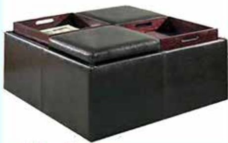
072 Storage & Tray Ottoman 36"W x 36"D x 20"H