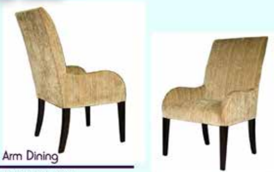
691 Arm Dining

Side: 20"W x 27"D x 42"H Arm: 24"W x 27"D x 42"H