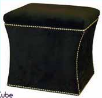
035 Curved Cube