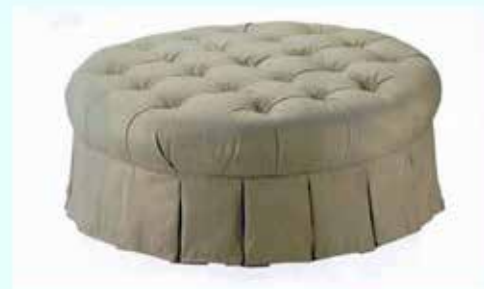
4736 Tufted Ottoman