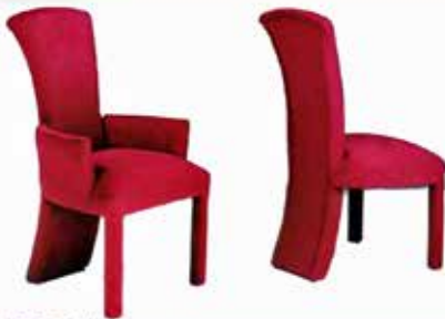
581 Arm & 580 Side Dining

Side: 22"W x 25"D x 40"H Arm: 24"W x 25"D x 40"H