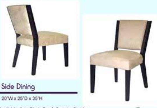
660 Side Dining