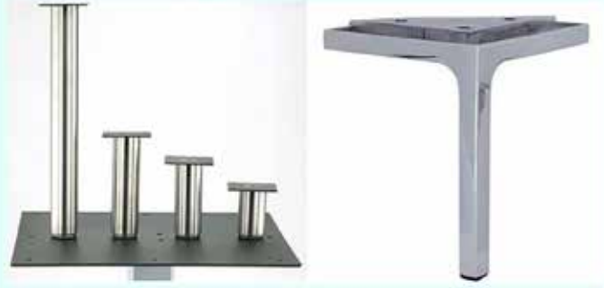
Round Stainless Steel Leg (Left), L-Shaped Leg A4E (Right)