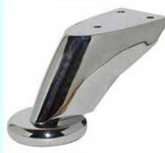
Angled Foot Pewter 4T2