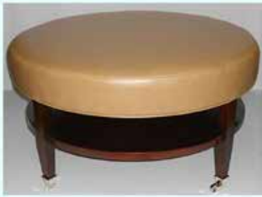
196 Round Shelf Ottoman