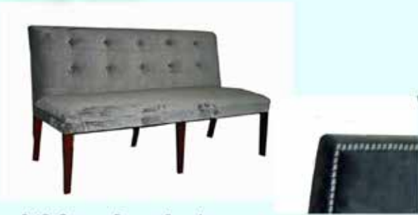
340 Custom Dining Bench