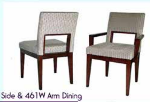
460W Side & 461W Arm Dining

Side: 20"W x 24"D x 34"H Arm: 23"W x 24"D x 34"H