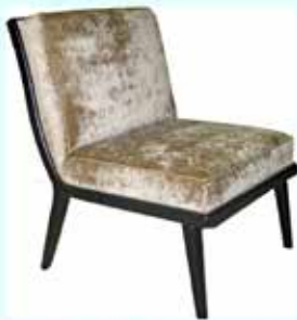
1020 Slipper Chair