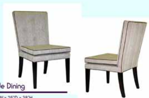
780 Side Dining