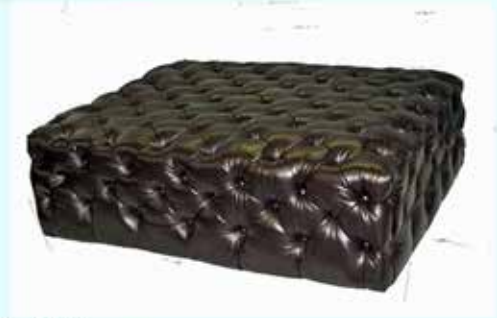
060 Tufted Ottoman