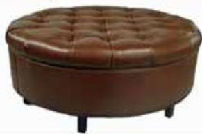
080 Ottoman & 082 Ottoman

080: 42" Round x 18"H 082: 36" Round x 18"H