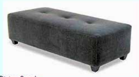
890 Dining Bench

Side: 56"W x 20"D x 19"H Also Available in Custom Widths