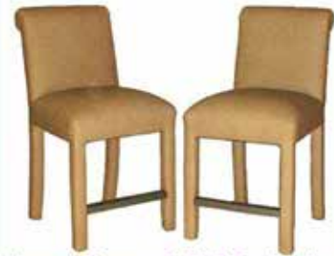
565 Fully Upholstered Counter & 568 Bar Stools

565: 20"W x 22"D x 38"H 568: 20"W x 22"D x 42"H