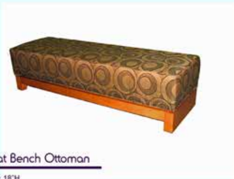
2100 Float Bench Ottoman