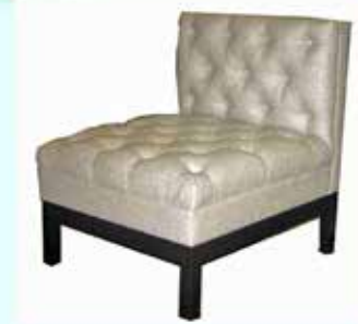
980 Chair - Hand Tufted Seat & Back