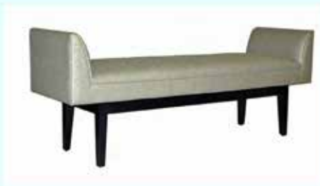
6000 Bench Ottoman