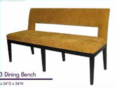
463 Dining Bench