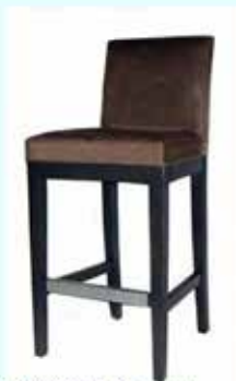
465NH Counter Stool & 468NH Barstool

465NH: 19"W x 21"D x 37"H 468NH: 19"W x 21"D x 43"H