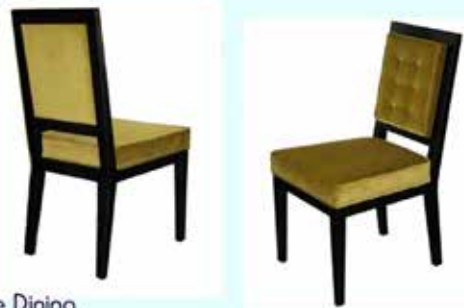
480 Side Dining

Side: 20"W x 24"D x 38"H Arm: 23"W x 24"D x 38"H