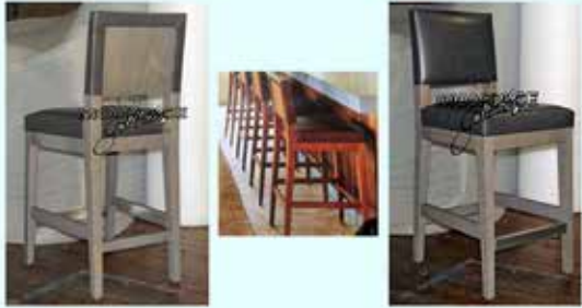
918 Counter Stool