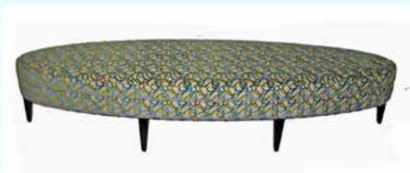
020 Oval Ottoman