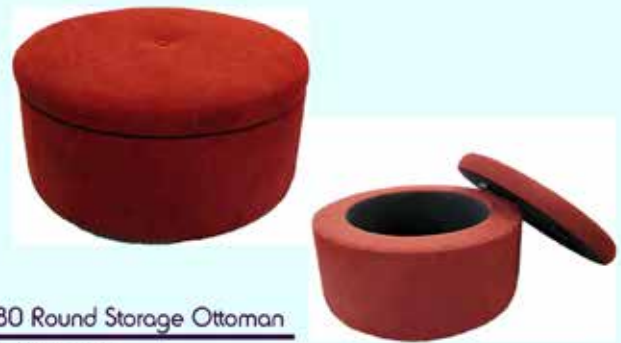
180 Round Storage Ottoman 36" Round x 19"H Also Available: 42", 24" Round : Storage & Non Storage