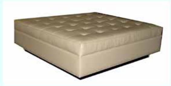
2400 Tufted Ottoman