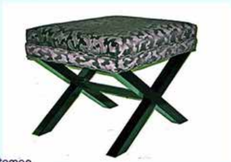
X - Ottoman