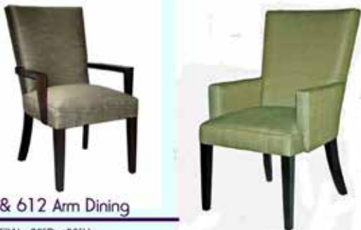
611 & 612 Arm Dining

611: 25"W x 29"D x 39"H 612: 25"W x 29"D x 39"H