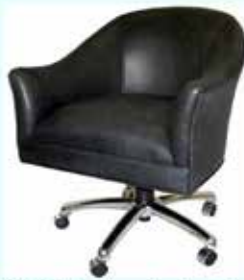
1002 Flair Arm Pedestal

27"W x 29"D x 32"H Also Available: Pedestal Base, Tight Seat