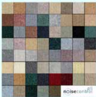
Noise Absorption Fabric