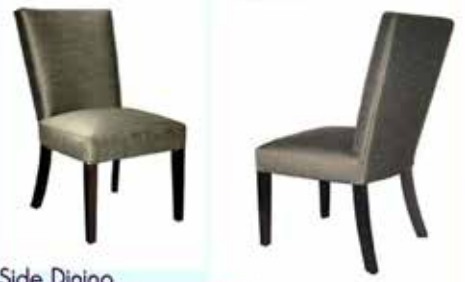
610 Side Dining

Side: 21"W x 29"D x 39"H Arm: 25"W x 29"D x 39"H