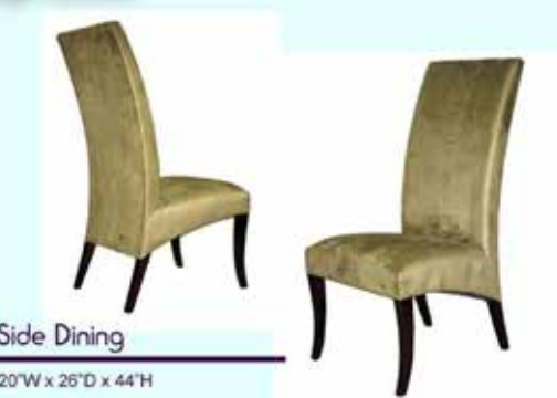
760 Side Dining