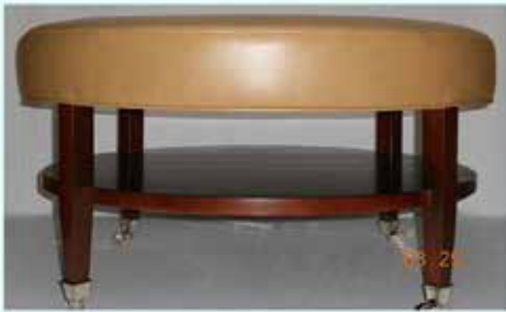
196 Round Shelf Ottoman