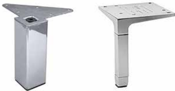
Offset Fountain Pen Foot 430 (Right), Square Furniture Legs (Set of Four) DC0