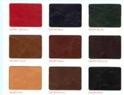
Faux Leather Collection