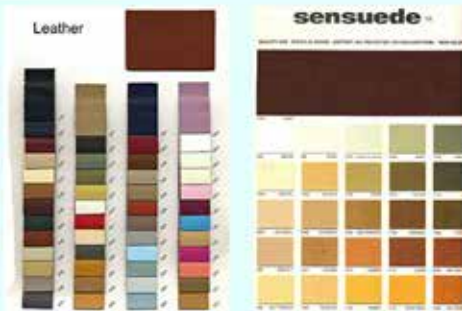
Leather & Sensuede