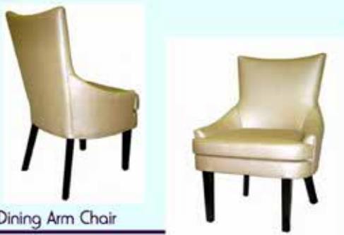
351S Dining Arm Chair