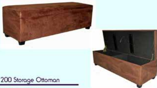
200 Storage Ottoman 60"W x 20"D x 18"H Also Available: 75"W & non-storage