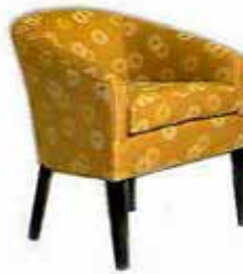
1001 Low Arm

25"W x 28"D x 31"H Also Available: Pedestal Base, Tight Seat