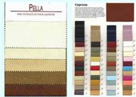
Pella Faux Leather & Caprone Leather