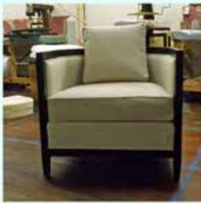
1010 Barrel Chair