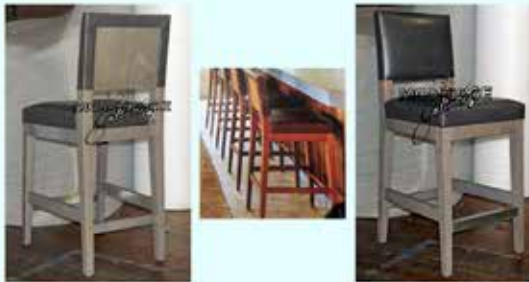
918 Counter Stool