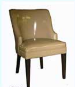
331 Arm Dining