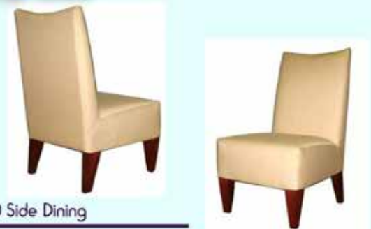
630 Side Dining