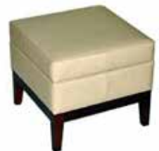
190 Ottoman & 192 Ottoman