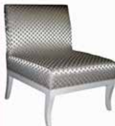
1030CL & 1030SL

28"W x 32"D x 35"H SH: 18" (CL= Curved Legs – SL= Strait Leg)